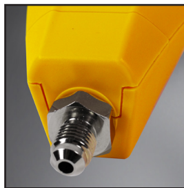
Wireless Vacuum Gauge Probe

Instant warm up and response time with an oil contamination and sensor failure detection.