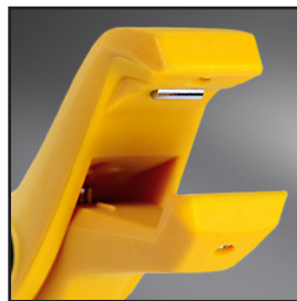
Wireless Pipe Clamp

Narrow head for tight spaces with a thermally isolated sensor for greater accuracy.