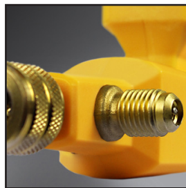
Wireless Pressure Probe

Pass thru port hook up, no hoses or adapters needed. 180° articulation allows access in tight spaces.