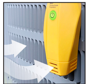
Outdoor Temperature Probe

Magnetic hanger allows for temperature measurements in direct air stream.